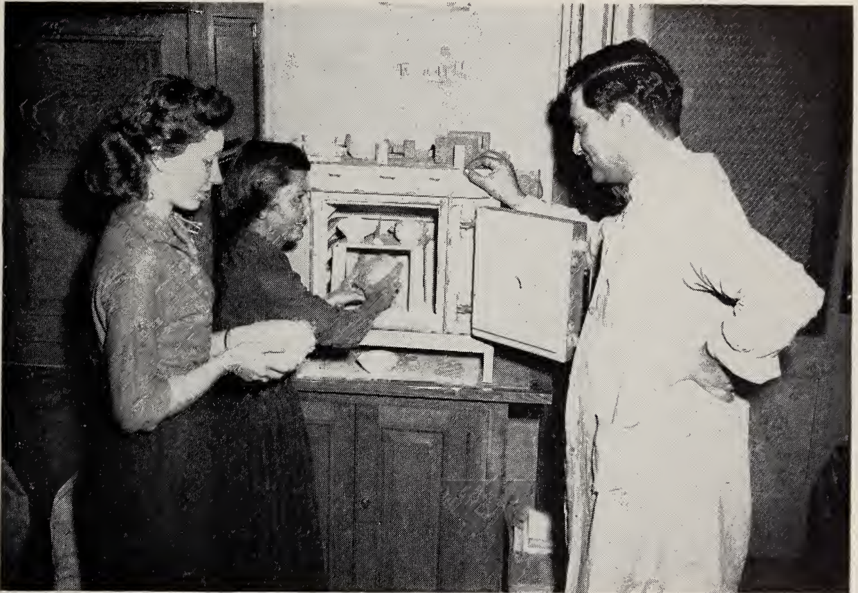
FIRST PICTURE OF KILN, 1956