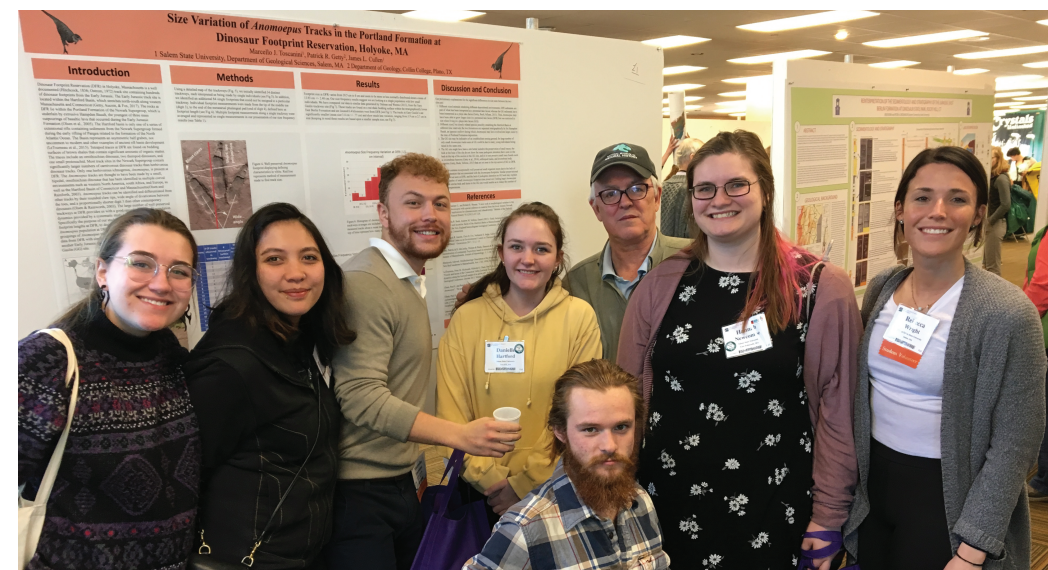
Figure 4. (a) Students at NEGSA 2019 in Portland, ME

NEGSA is a geological annual conference that brings together geologist and students from the local section to present their latest research advancements, network, attend guest lectures and workshops, and be exposed to the current state of the art research and technologies. The conference was held on March 16th through the 19th in Portland (Maine) and hosted by the Maine Geological Survey, Maine Mineral and Gem Museum, S.W. Cole Engineering Inc., University of Maine in Farmington, and the University of Maine. The students presented their research during the poster sessions.