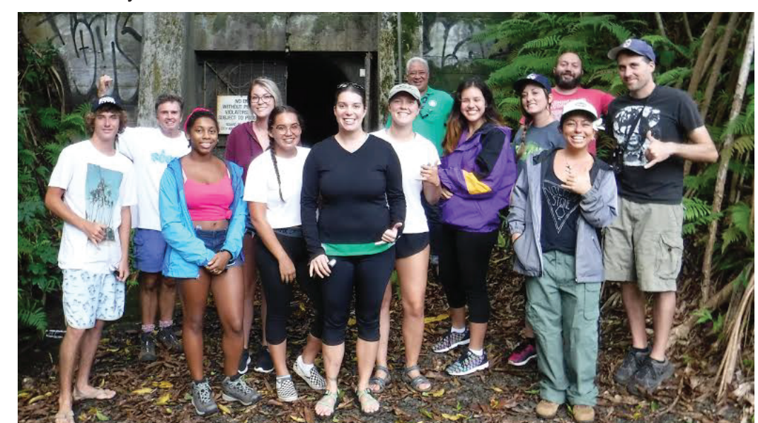
Figure 1. Hydrology Field trips. Dike Groundwater Reserve group photo.