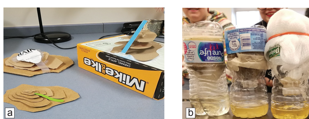
Figure 2. (a) Students made 3D models of topographic maps to identify where rivers flow; and (b) researched how water filters are made, and then "budgeted" to create a cost effective water filter.

Think back to the moment you decided to study geology. What made you take that decision? While we all have our own paths to end up in this wonderful major, our choices can oftentimes be driven by a passionate educator. I think there is nothing more powerful than an energized teacher who brings the content alive and empowers their students to excel. At Salem State, we are fortunate to have amazing faculty in the Geology department who help undergrads find their love for geology. Unfortunately for me, I never liked science until college. I found high school classes boring, uninteresting, and irrelevant to my life. This shocks most of my students because now my career is teaching high school science and I love every minute of it. I am finishing up my first full year as a high school Earth Science teacher. This year I taught three sections of Earth Science and two sections of Marine Biology. I have had the opportunity to teach students in all