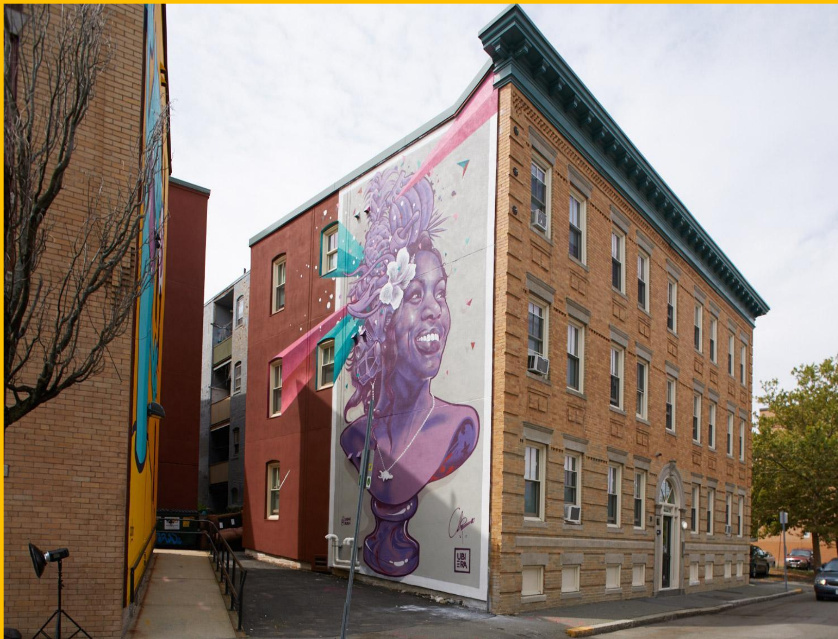
Anacaona street view