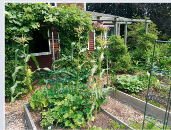
Wellspring's on-site gardens

I carried out the following tasks with approval from staff: