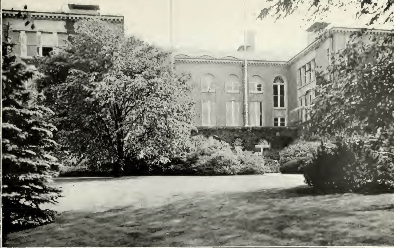
STATE TEACHERS COLLEGE