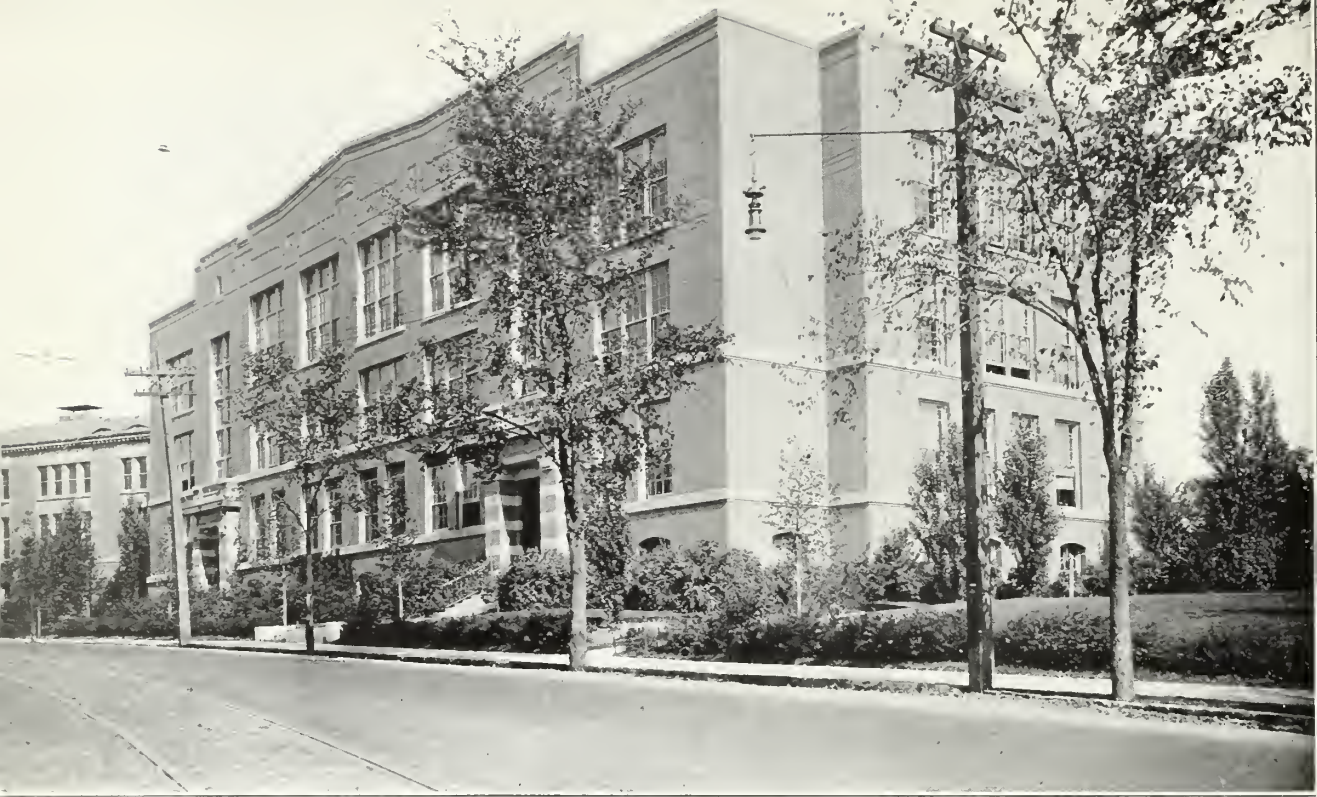
HORACE MANN TRAINING SCHOOL