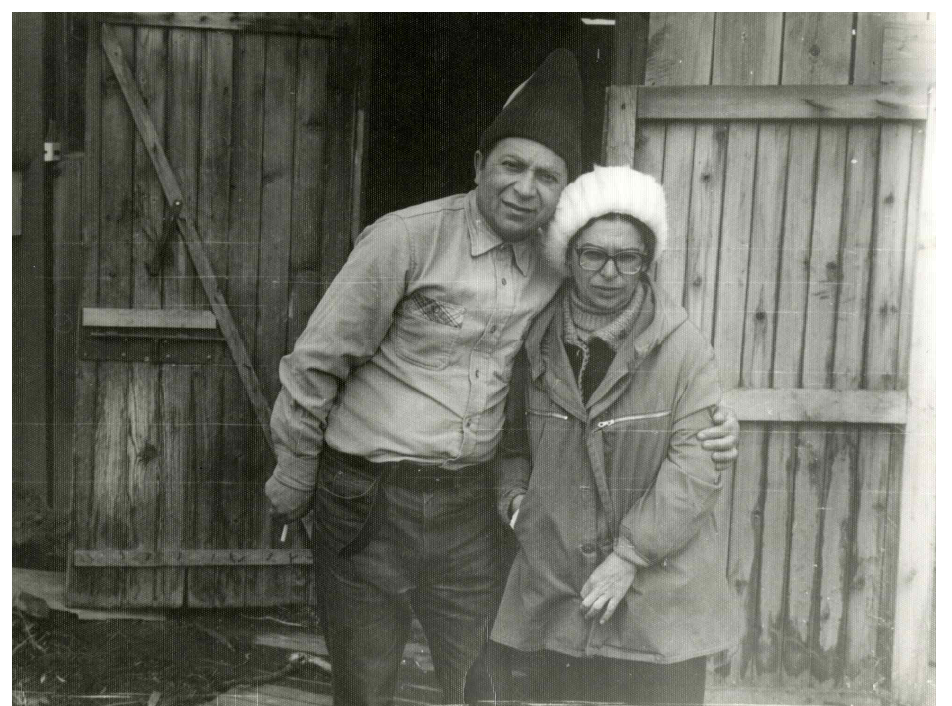
Ida Nudel, the “Guardian Angel” of refuseniks, in exile in Siberia.