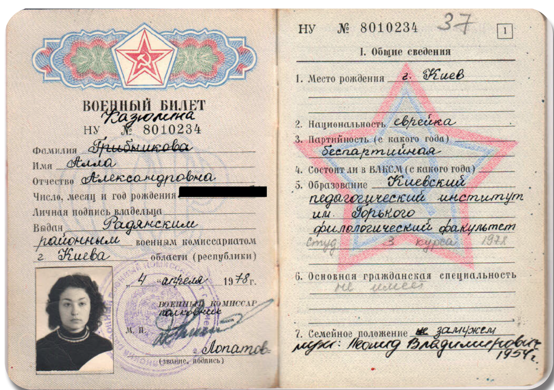
In addition to passports, military identity cards also listed one’s nationality. This identity card belonged to a Jewish student. Her nationality is listed on line 2.