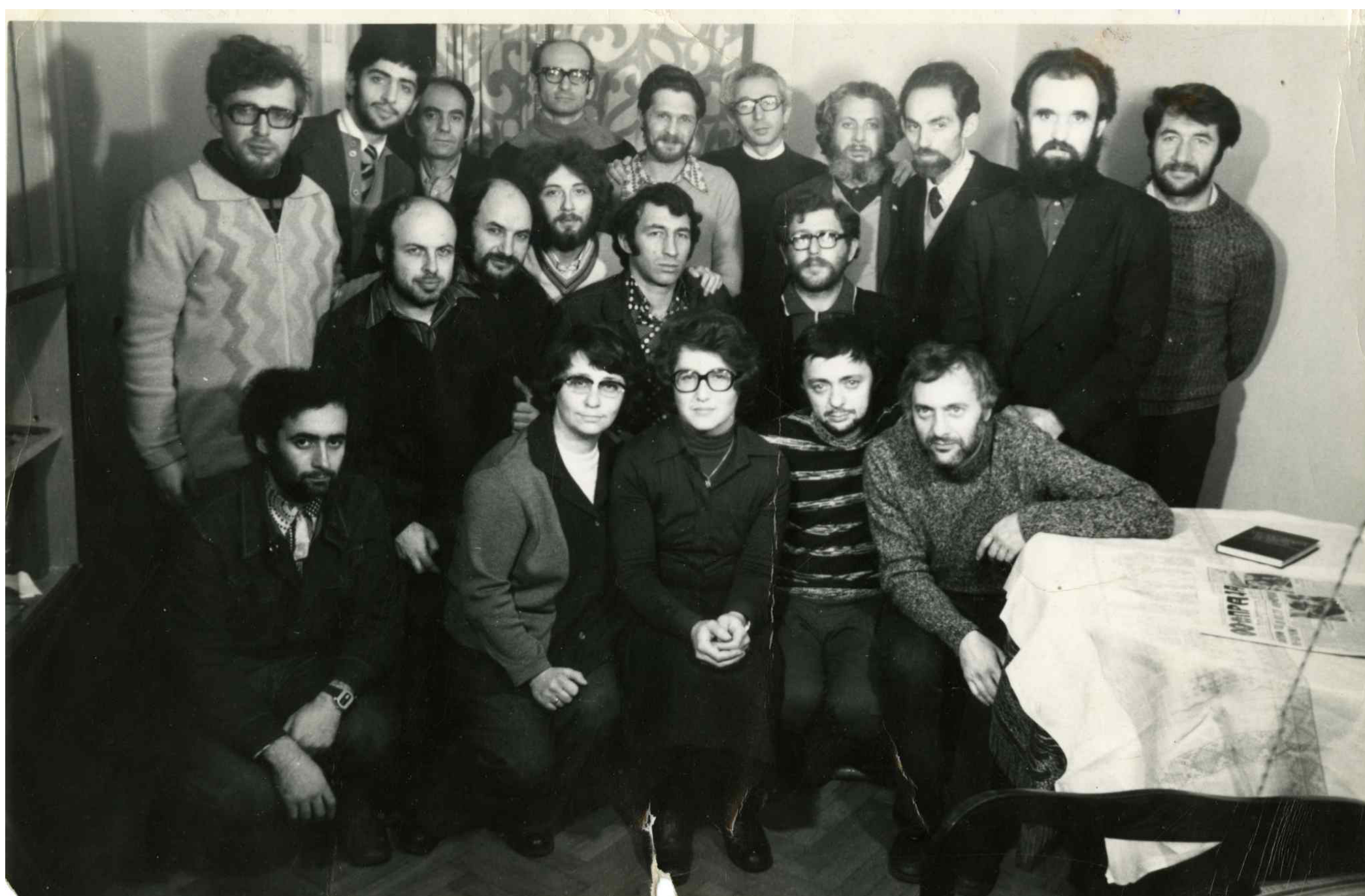
Anatoly Sharansky with other refuseniks at an underground meeting.