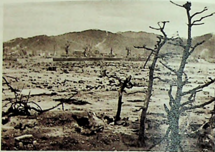
Post-bomb Hiroshima, 1945.